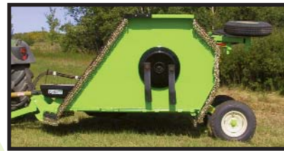
Standard stump jumpers