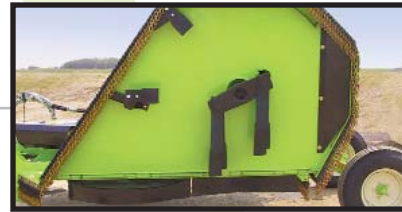
Fixed knife unit with distribution kit