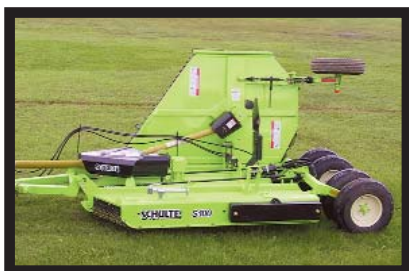
- S100 unit shown above -

Heavy Duty Mower at a Mid Range Price 7 Gauge Continuously Welded Deck