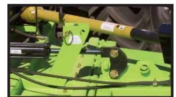
Floating Wing Lug allows movement of 25° down to 35° up

Schulte Industries Ltd. reserves the right to change the design, material and specifications of its products without notice. Illustrations may include optional equipment and accessories, and may not include all standard equipment. Part No. 1000-154