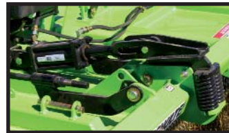
Floating hitch & center spring suspension

Mechanical free floating hitch and wings frames allow the cutter to more easily clear obstructions. Six inch blade overlap and high blade tip speeds ensure clean cutting.