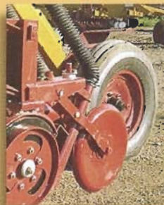
...oversized seed tubes