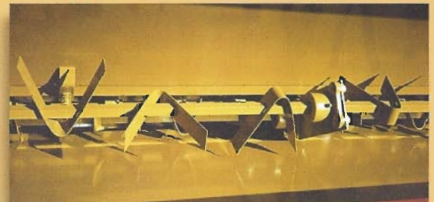
...agitators placed in the rear seed box.