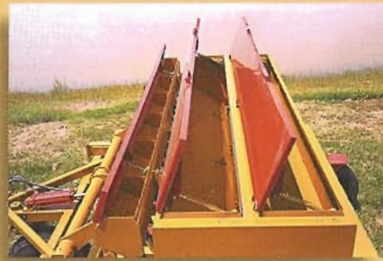
1"x12" dual "V" rubber

The 107 has two seed boxes with individual metering. The third box is the optional legume box.